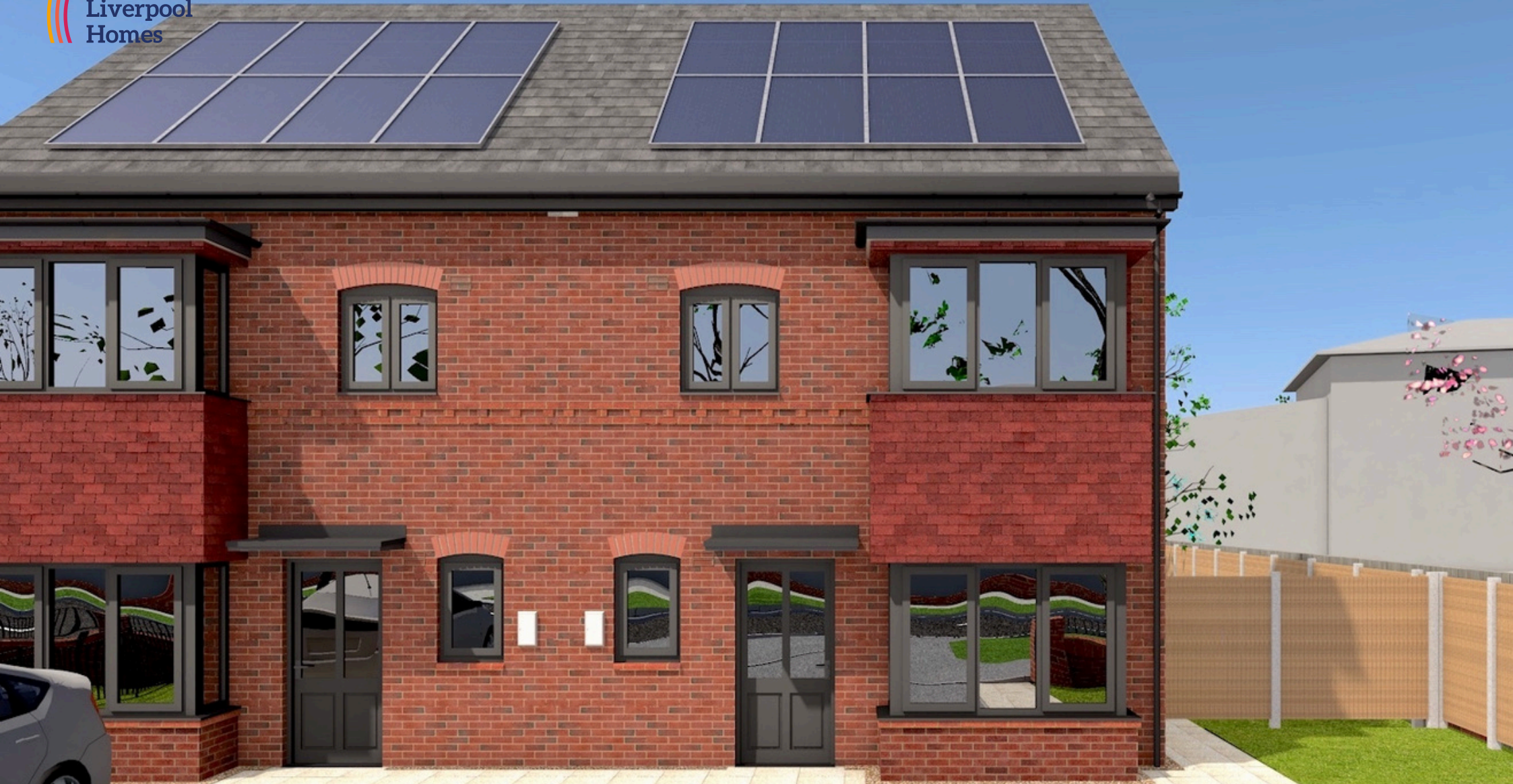
South Parade - Four bed semi-detached house