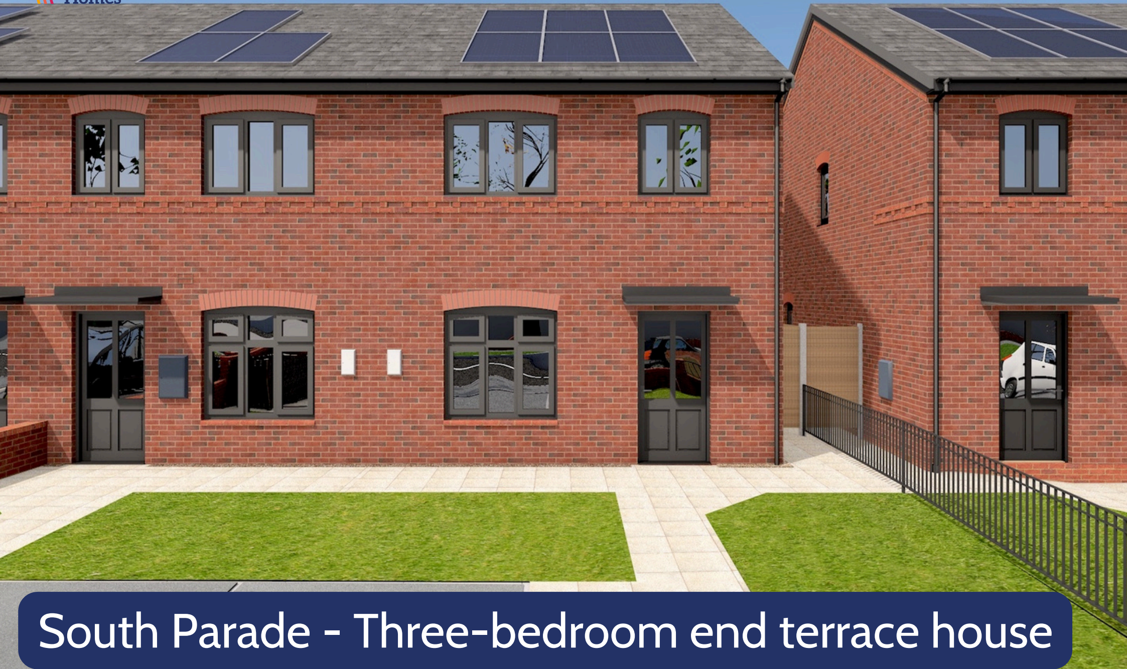
South Parade - Three-bedroom end terrace house