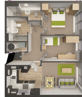
Apartment 32 Third floor

Key FF - First floor SF - Second floor TF - Third floor