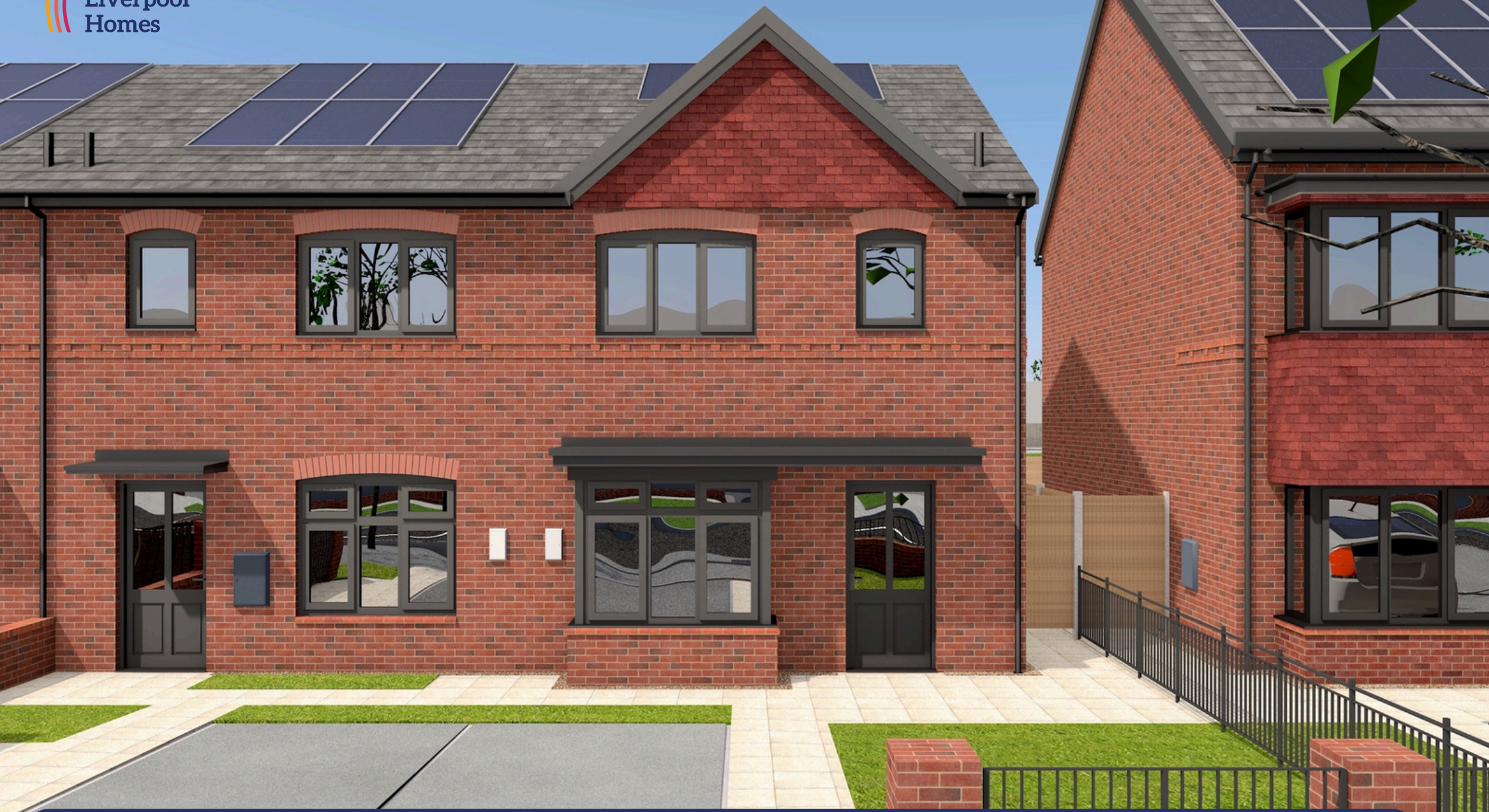
South Parade - Three-bedroom end terrace house