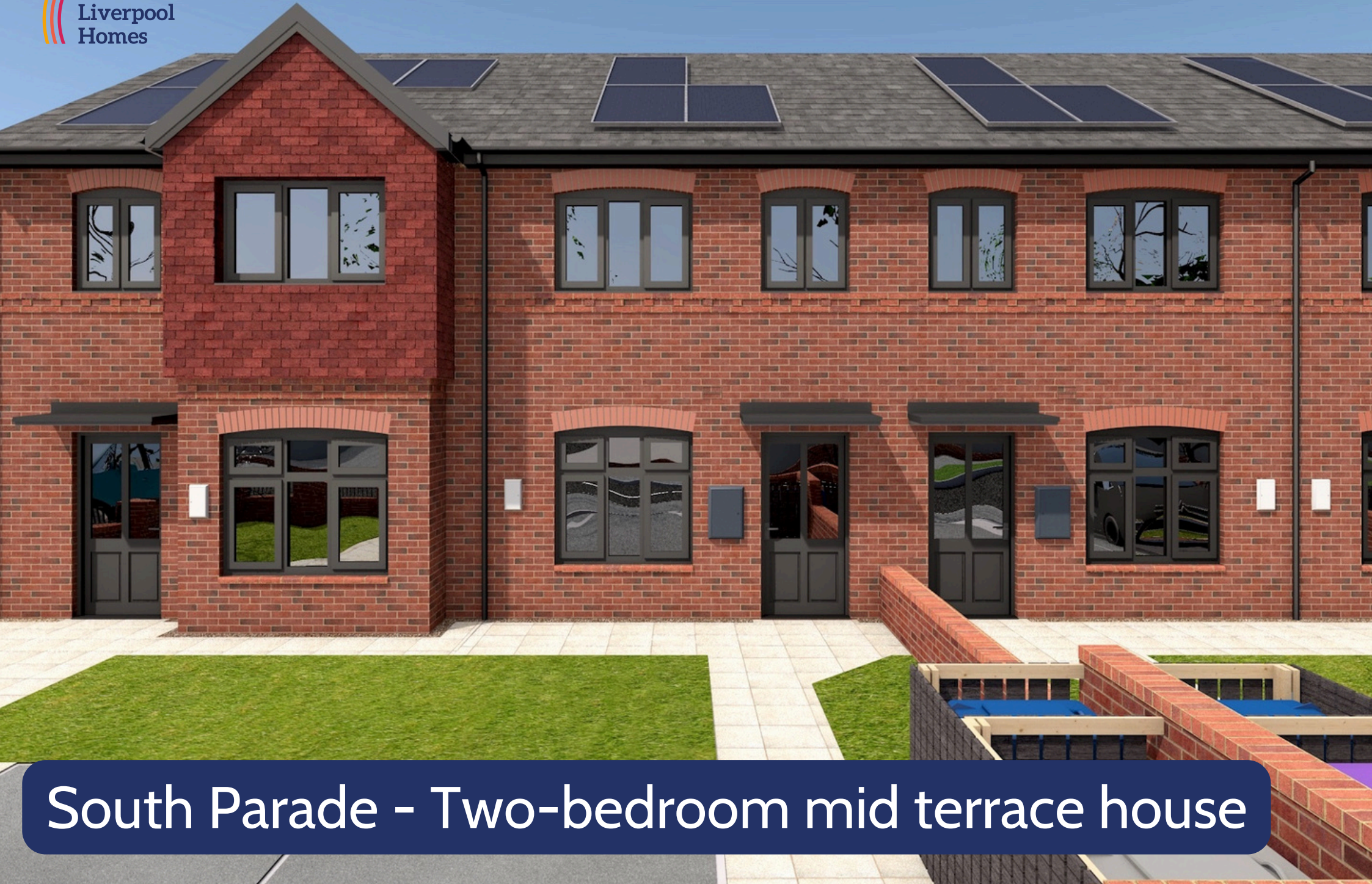
South Parade - Two-bedroom mid terrace house