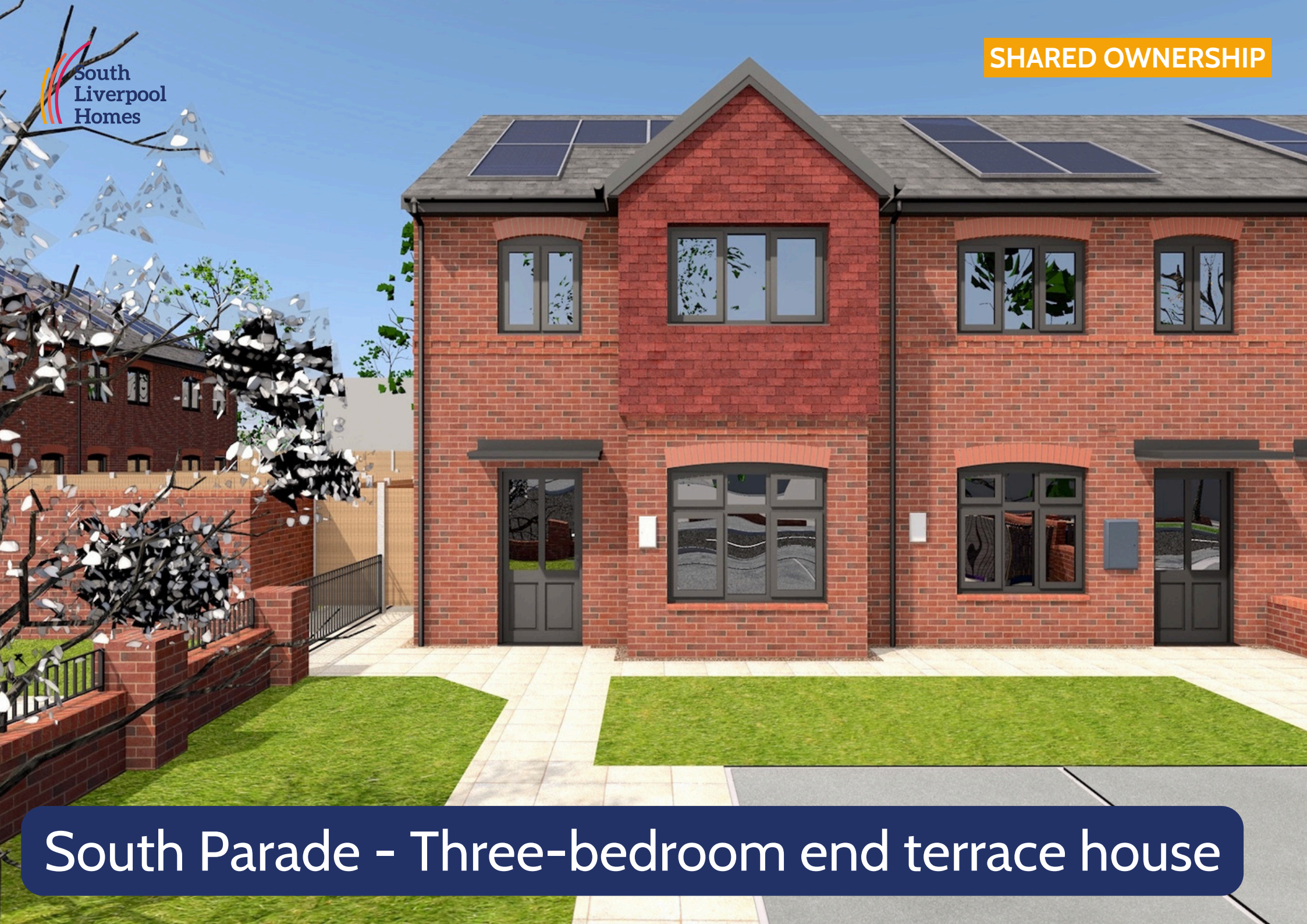
South Parade - Three-bedroom end terrace house