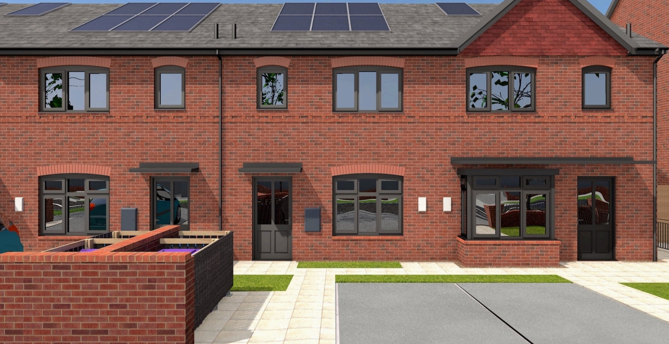
South Parade - Three-bedroom mid terrace house